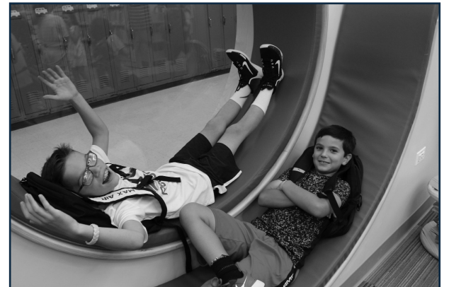
These two get the best seats in the house at the new Harper School Learning Commons