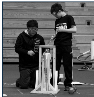
D39 students compete at Science Olympiad state competition last spring.

For more information and to purchase tickets to Foundation events, visit www.d39foundation.org .